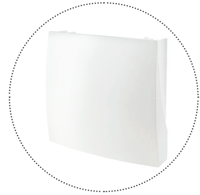
Q gateway 5 battery-operated or with power supply available

Its wide functional range makes Q gateway 5 the ideal solution for all applications and projects which require full energy autonomy at the location where the gateway is used. In combination with the functions of the Q SMP, Q gateway 5 makes a major contribution to significant savings of time, work and expense.